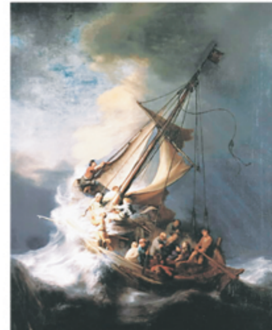
"The Storm on the Sea of Galilee," by Rembrandt