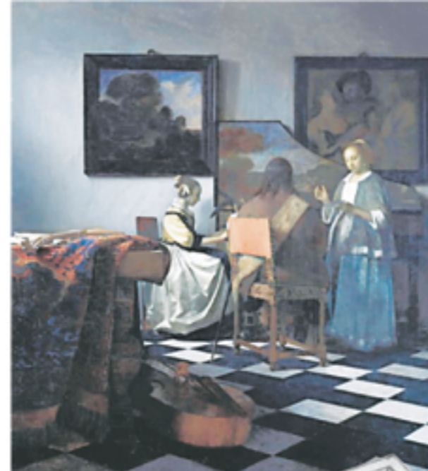
"The Concert" by Vermeer