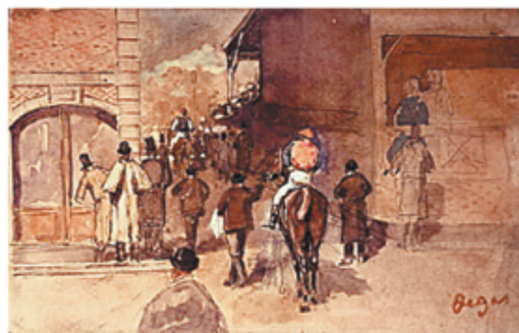
"La Sortie du Pelage" by Degas

Reconstruction based on alarm times and eyewitness accounts.