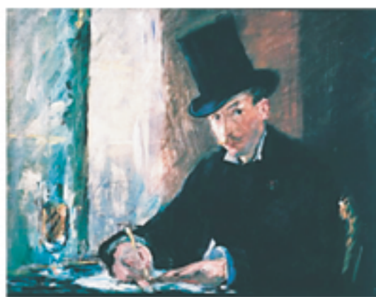
"Chez Tortoni," by Edouard Manet